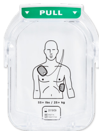
ADULT DEFIBRILLATOR PADS