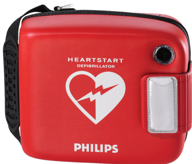
PROTECTIVE CARRY CASE